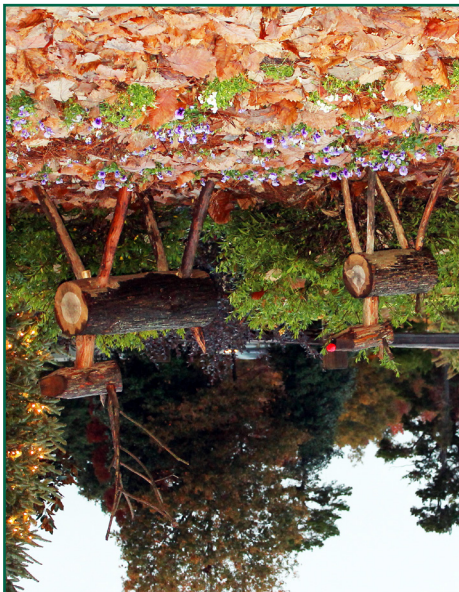
EYE SPY ANSWER: This "bloom" is really the red nose of the annual Christmas coccinella on a wooden reindeer, which is part of the annual Christmas decorations at the entrance of the Botanic Gardens.