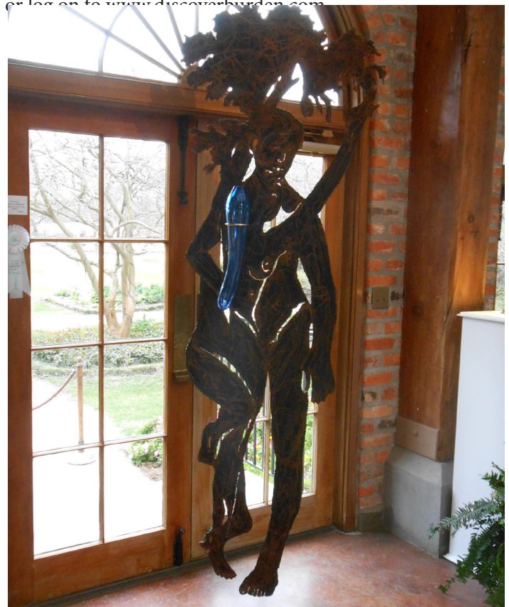
Last year's Judge's Choice artwork by Paulo Dufour

Come celebrate Louisiana's talented artists as a sponsor of the fourth annual Brush with Burden art exhibition. A juried multi-media exhibition, Brush with Burden features all types of art inspired by Louisiana's natural beauty, flora and fauna. For more information, call (225) 763-3990 or log on to www.discoverburden.com .