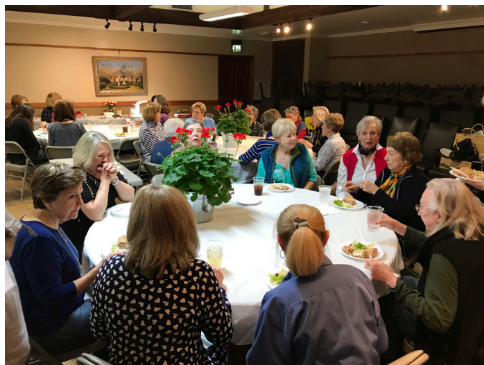
Lunchtime at icon workshop