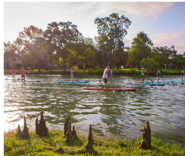
Louisiana’s wildlife and nature is unrivaled in beauty.

#1 MIDSIZED CITY FOR BUSINESS COST FRIENDLINESS KPMG, Competitive Alternatives, 2016