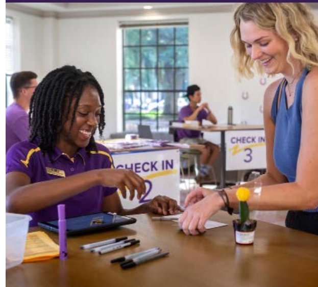
Balancing student development and community logistics gives RCs opportunities to make decisions and build skills.