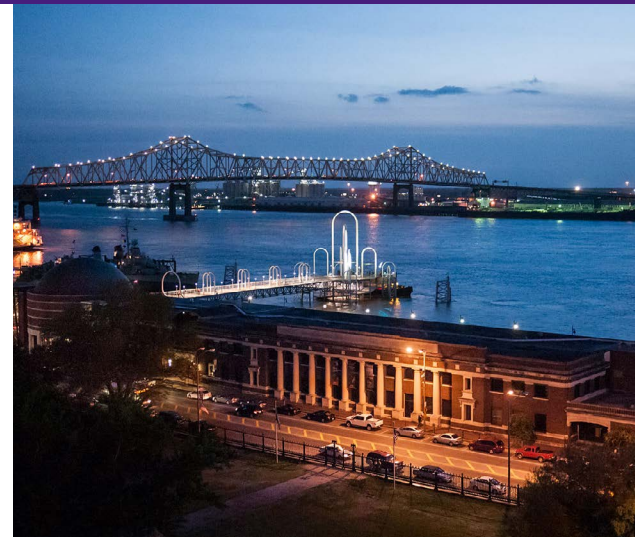
Downtown Baton Rouge has numerous leisure, culinary, and cultural activities in which to participate.

Our city boasts award-winning public and private school options ; more than 900 restaurants ; live concerts ranging from home-grown favorites to superstars like Kenny Chesney and James Taylor; a world-leading medical research center ; a variety of museums , including one that houses a 65-million year- old triceratops skull and a 5,000-year-old mummy; a nationally recognized, award-winning public library system ; more than 180 parks across the region; and much more. No matter your age or interest, the Baton Rouge Area is a great place to call home.