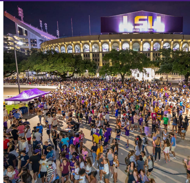
After hours and weekend work is part of showing up for students where they are, like this Welcome Week block party hosted by RHA.