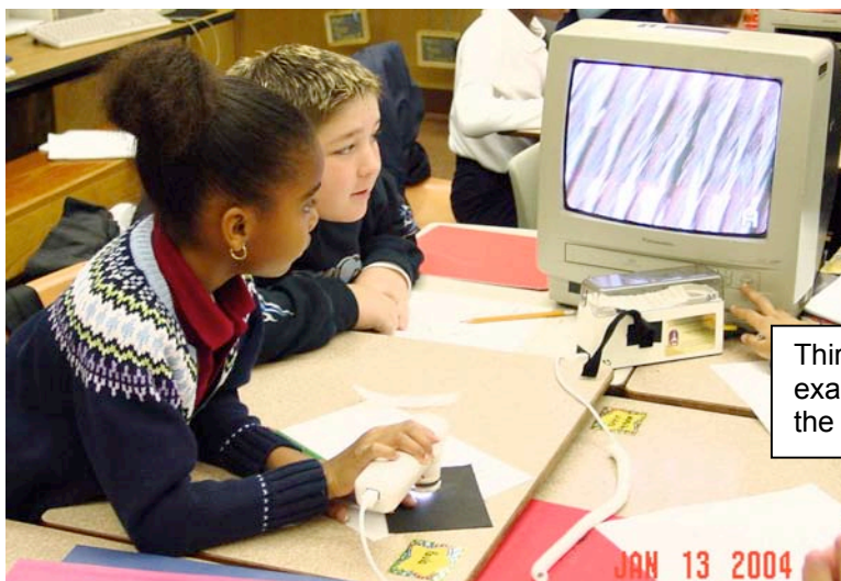
Third-grade students examine a bird feather with the Scope-On-A-Rope.

http://www.zoomschool.com/coloring (animal printouts)