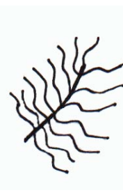
Downy Feather (small, lacking structured vanes)